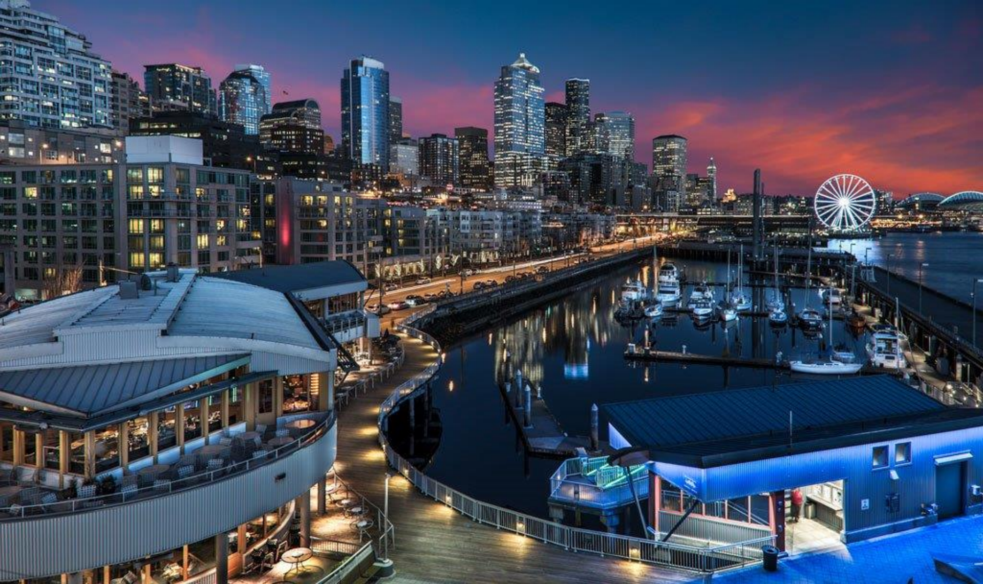
Seattle Skyline