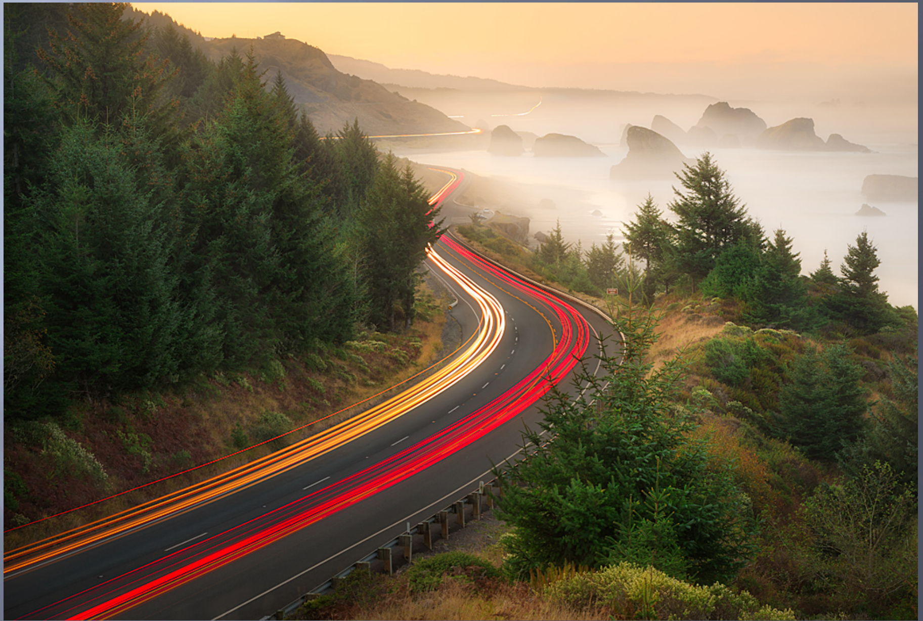
Gold Beach Rush Hour, by Cody Cha, YAAP