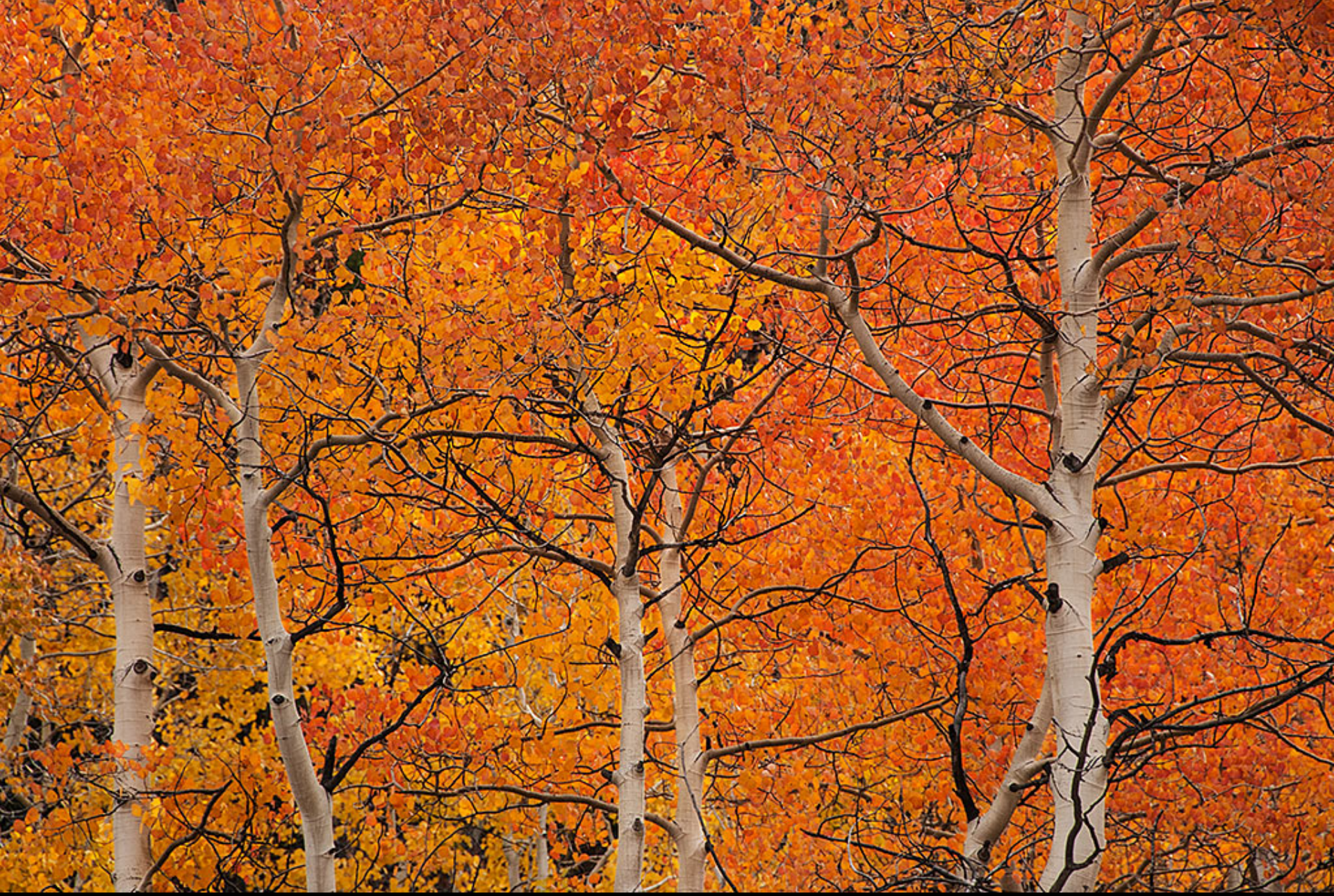
Aspen Color – Drinda Battaile