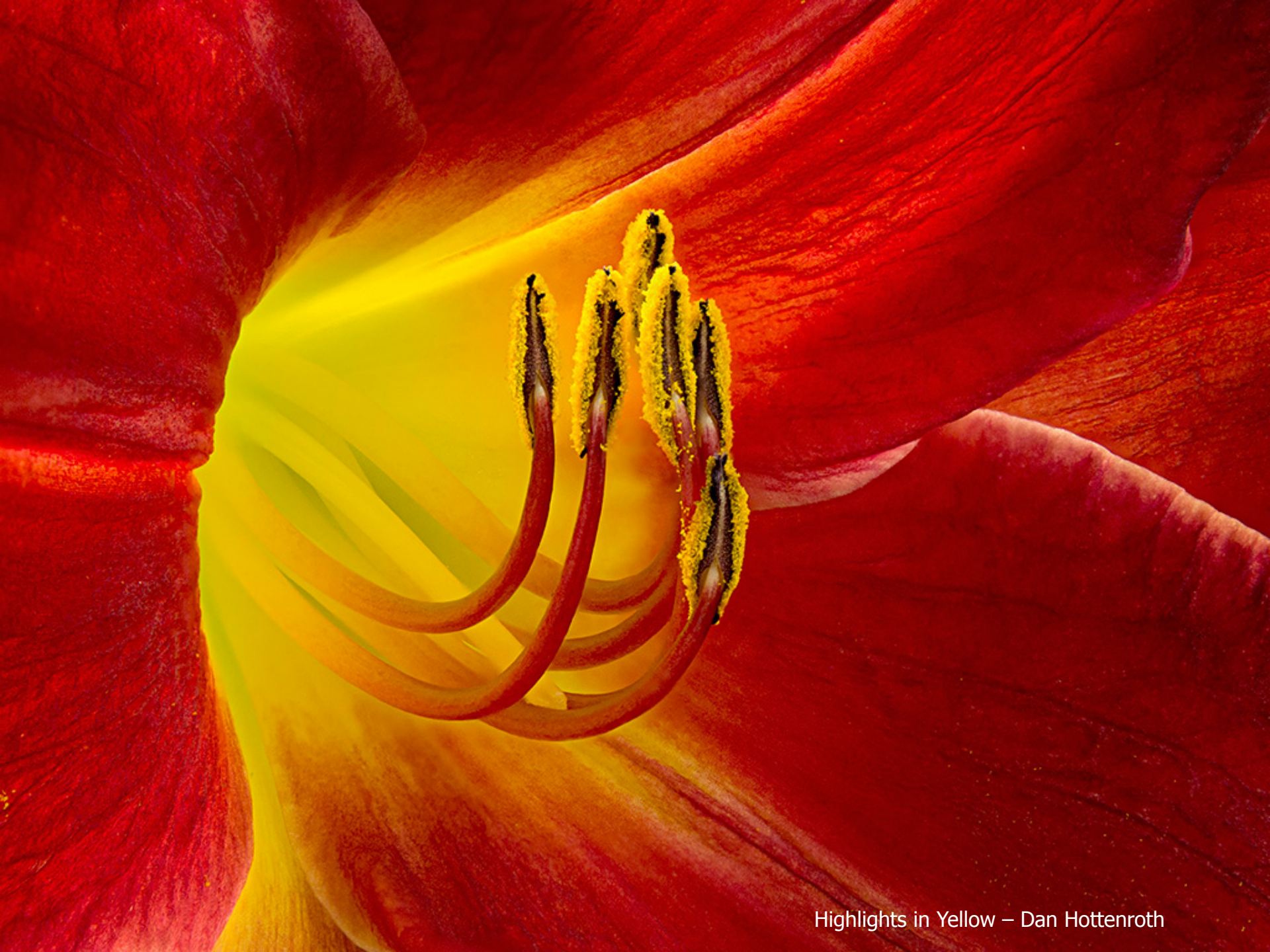
Highlights in Yellow – Dan Hottenroth