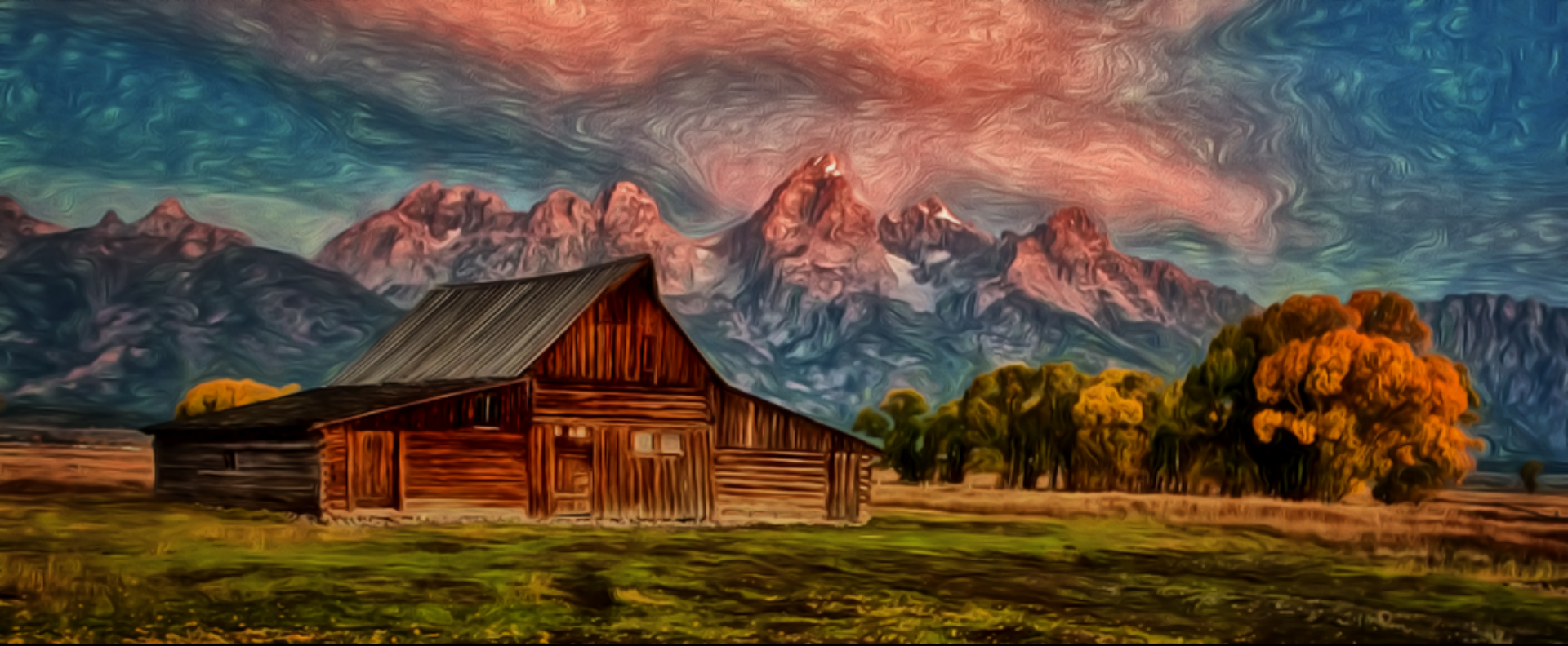
Moulton Barn