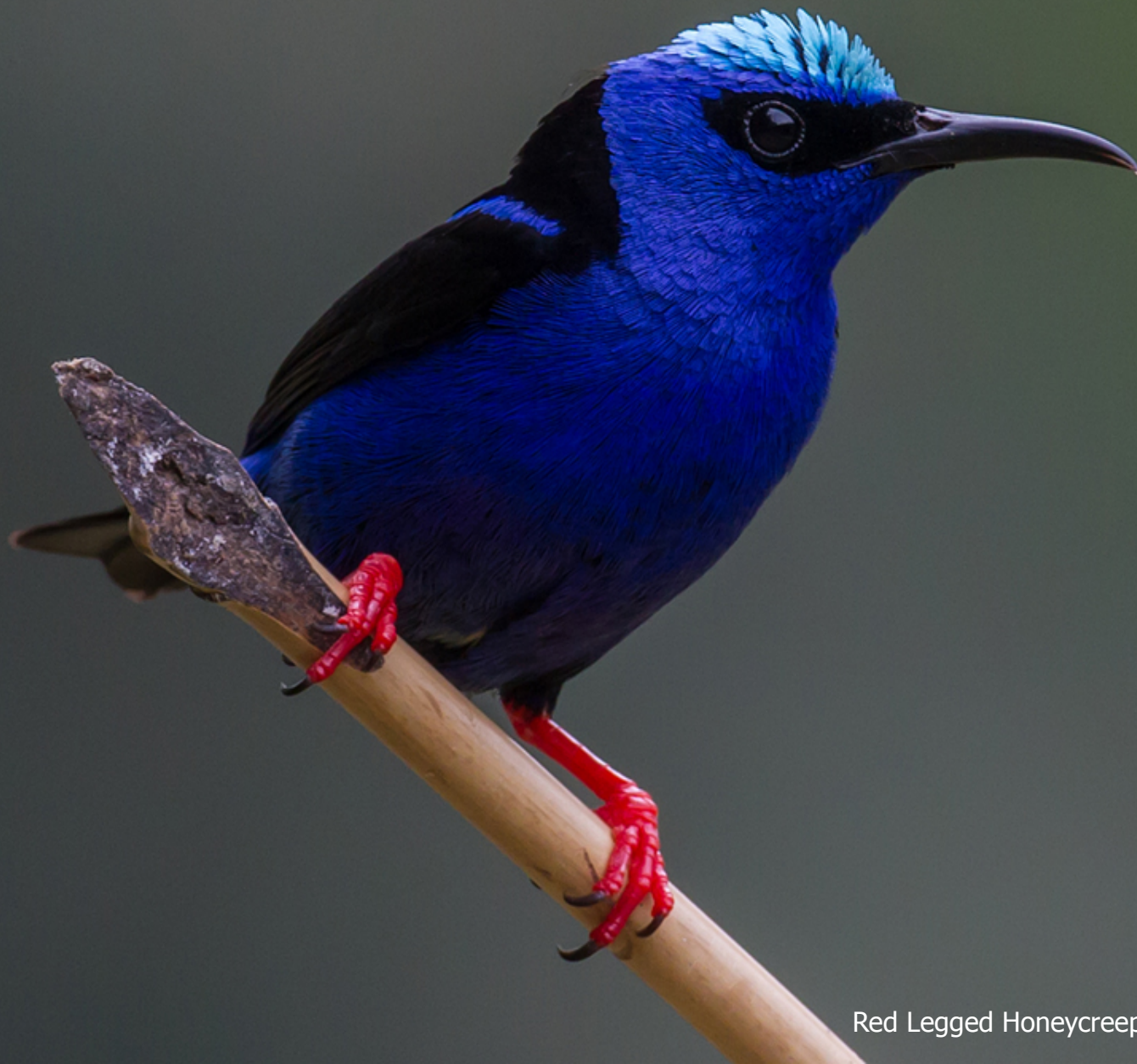
Red Legged Honeycreeper