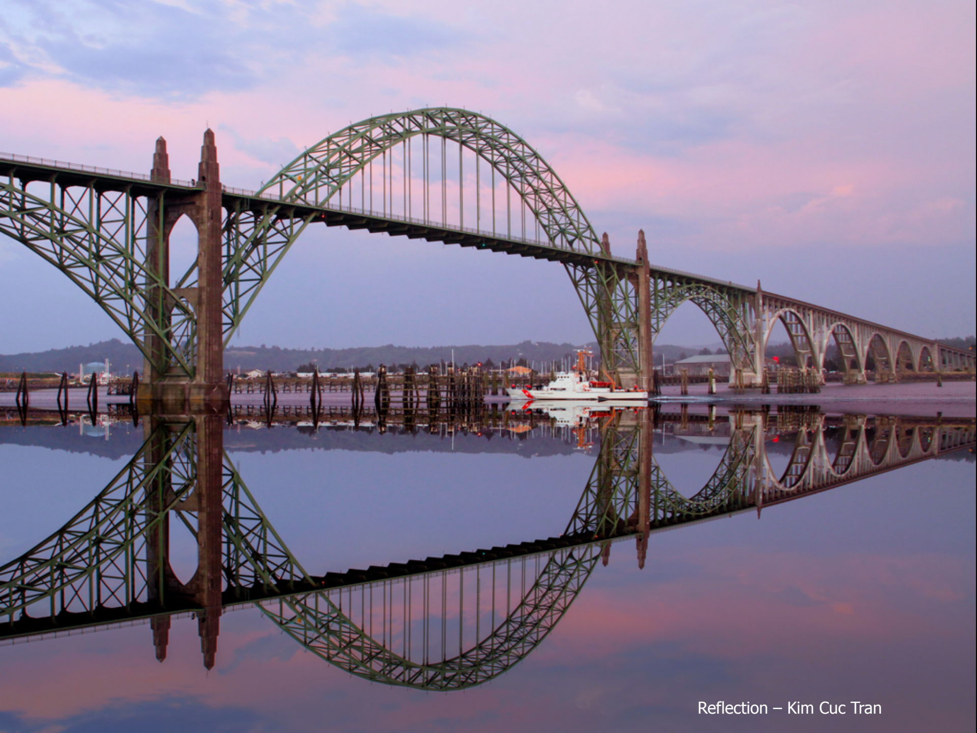
Reflection – Kim Cuc Tran