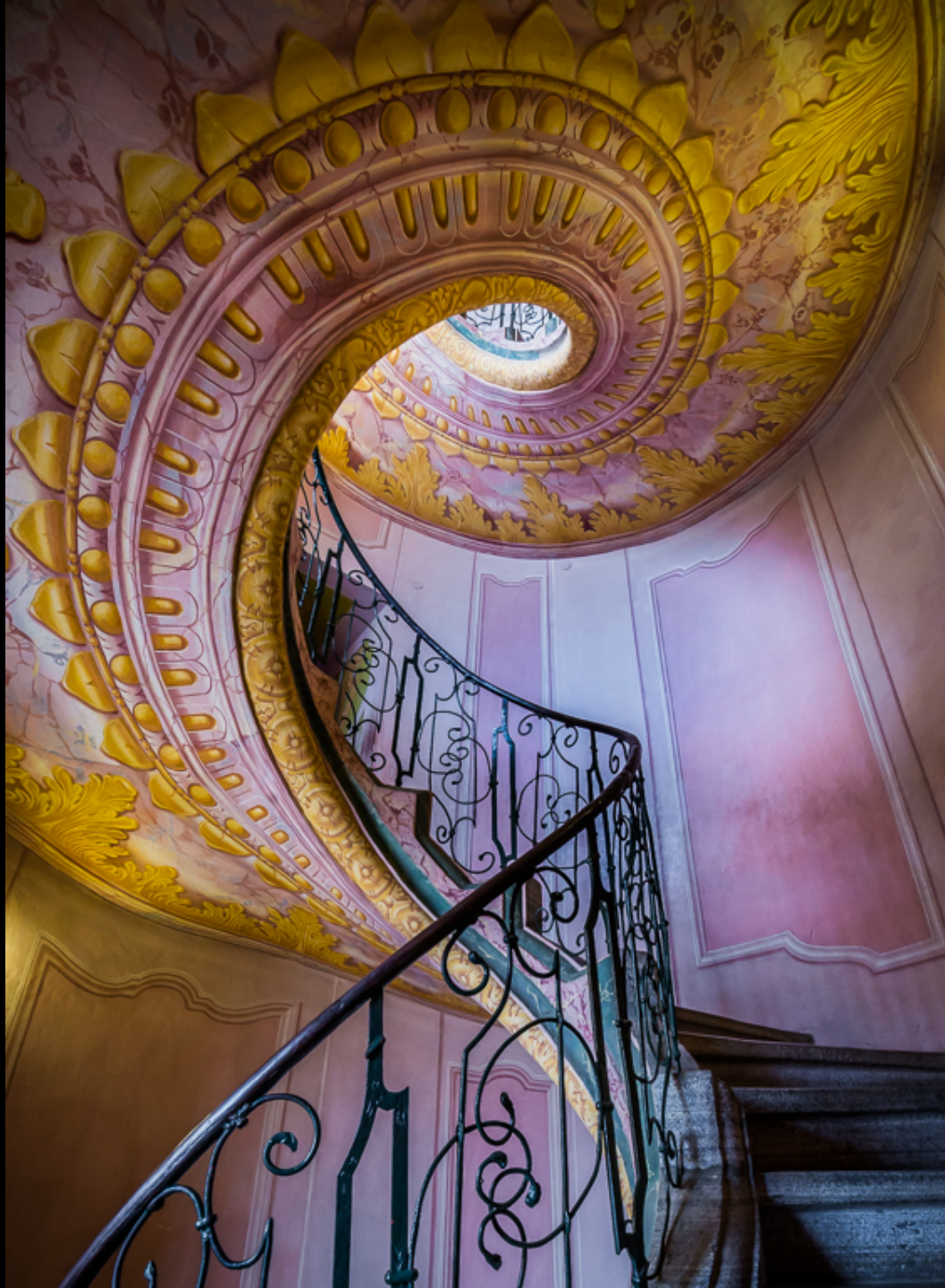
Melk Abbey Stairs