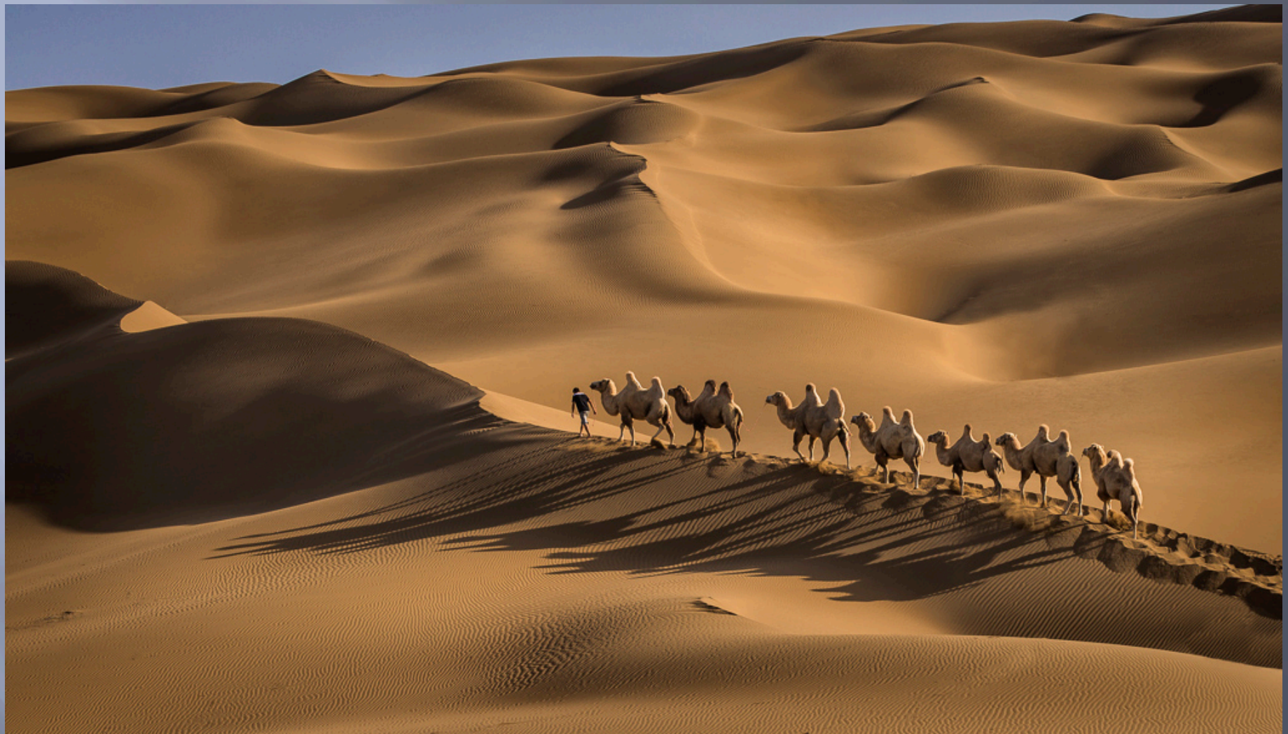
Camels in a Line 3 by Sharp Todd, FPSA, GMPSA, FPCC