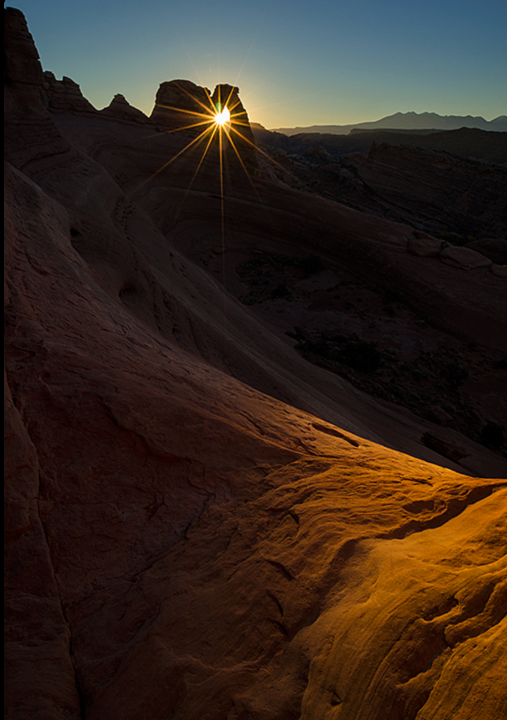
Delicate Beam of Light