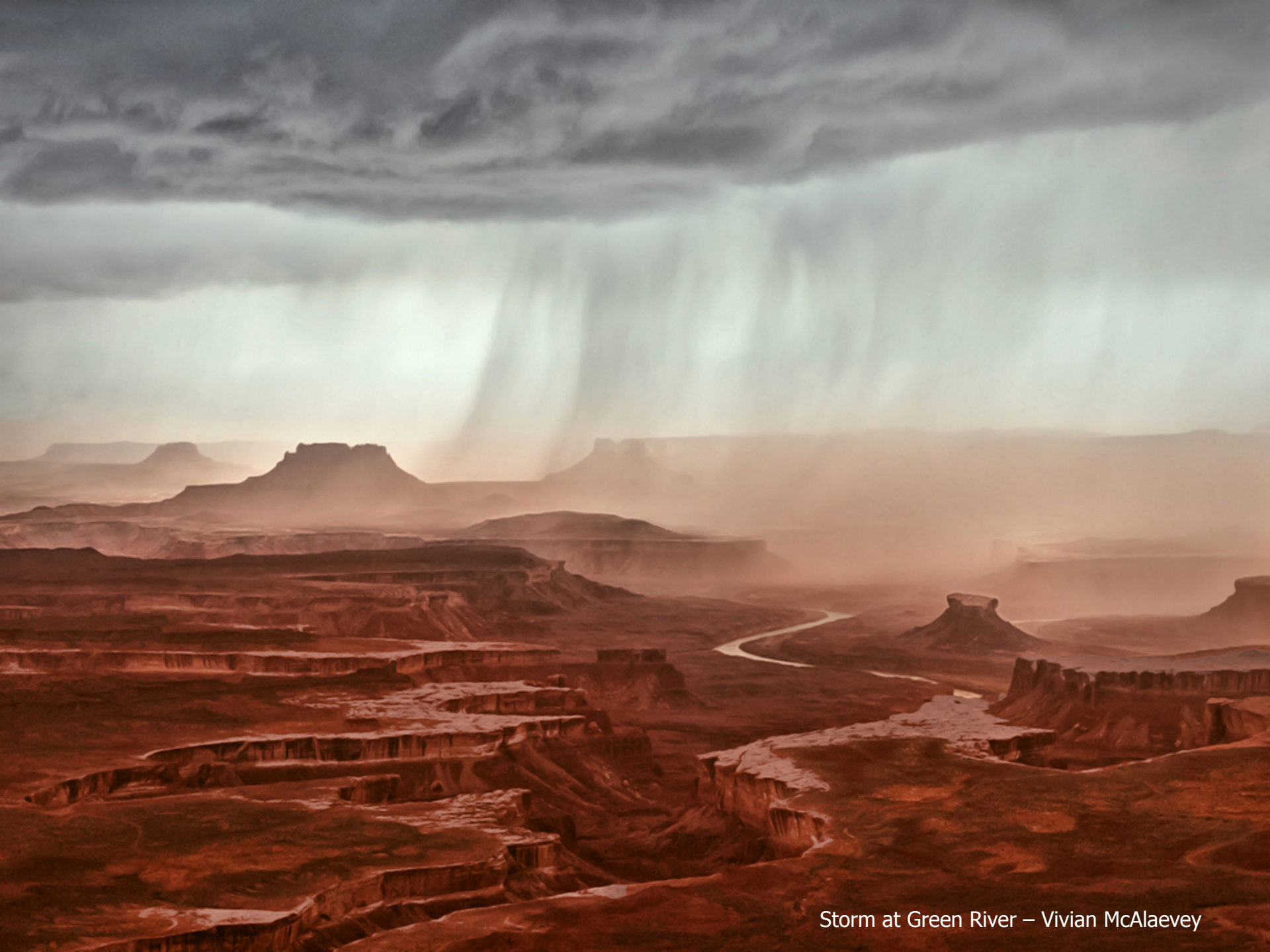
Storm at Green River – Vivian McAlaevey