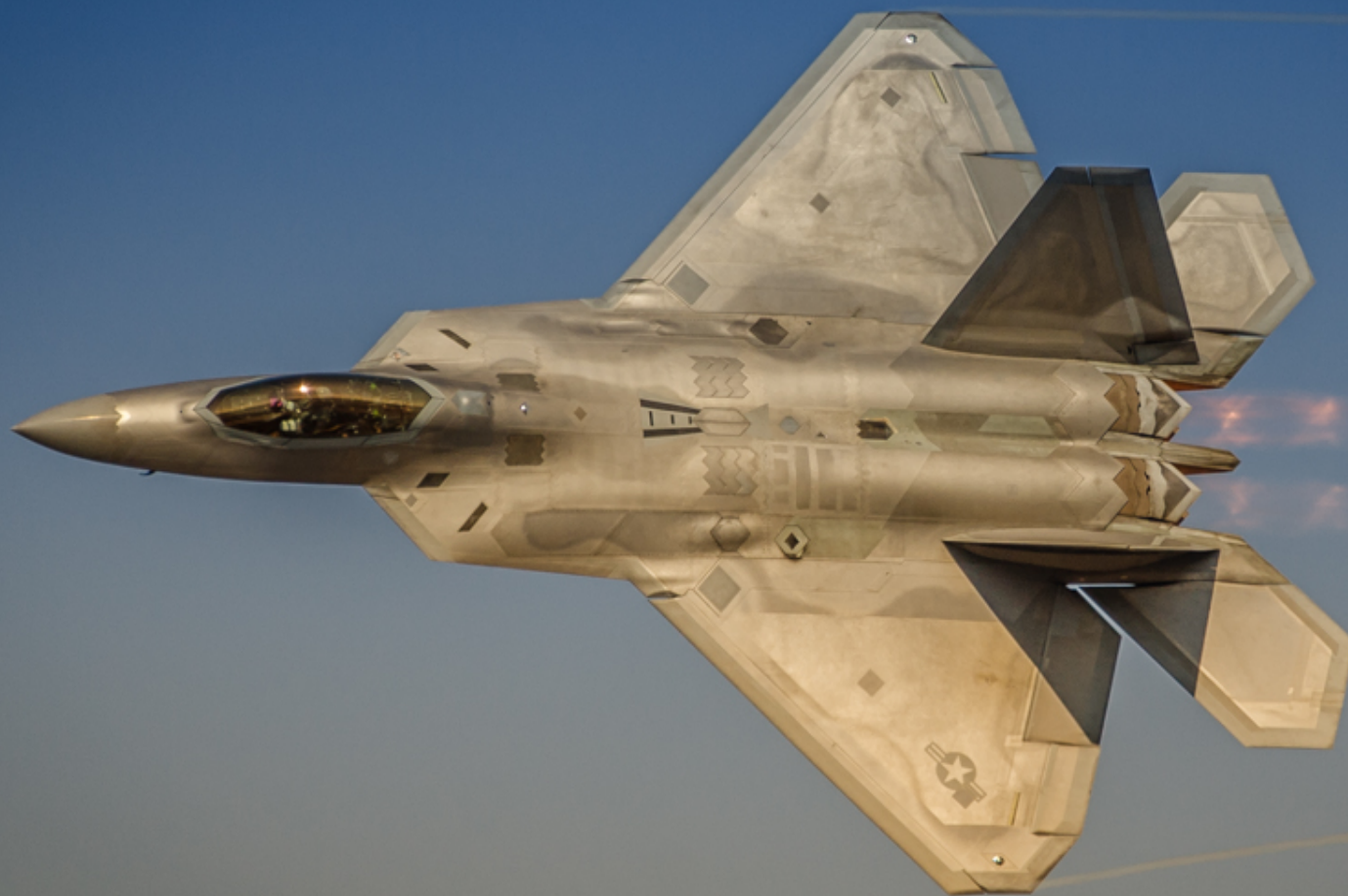
Raptor