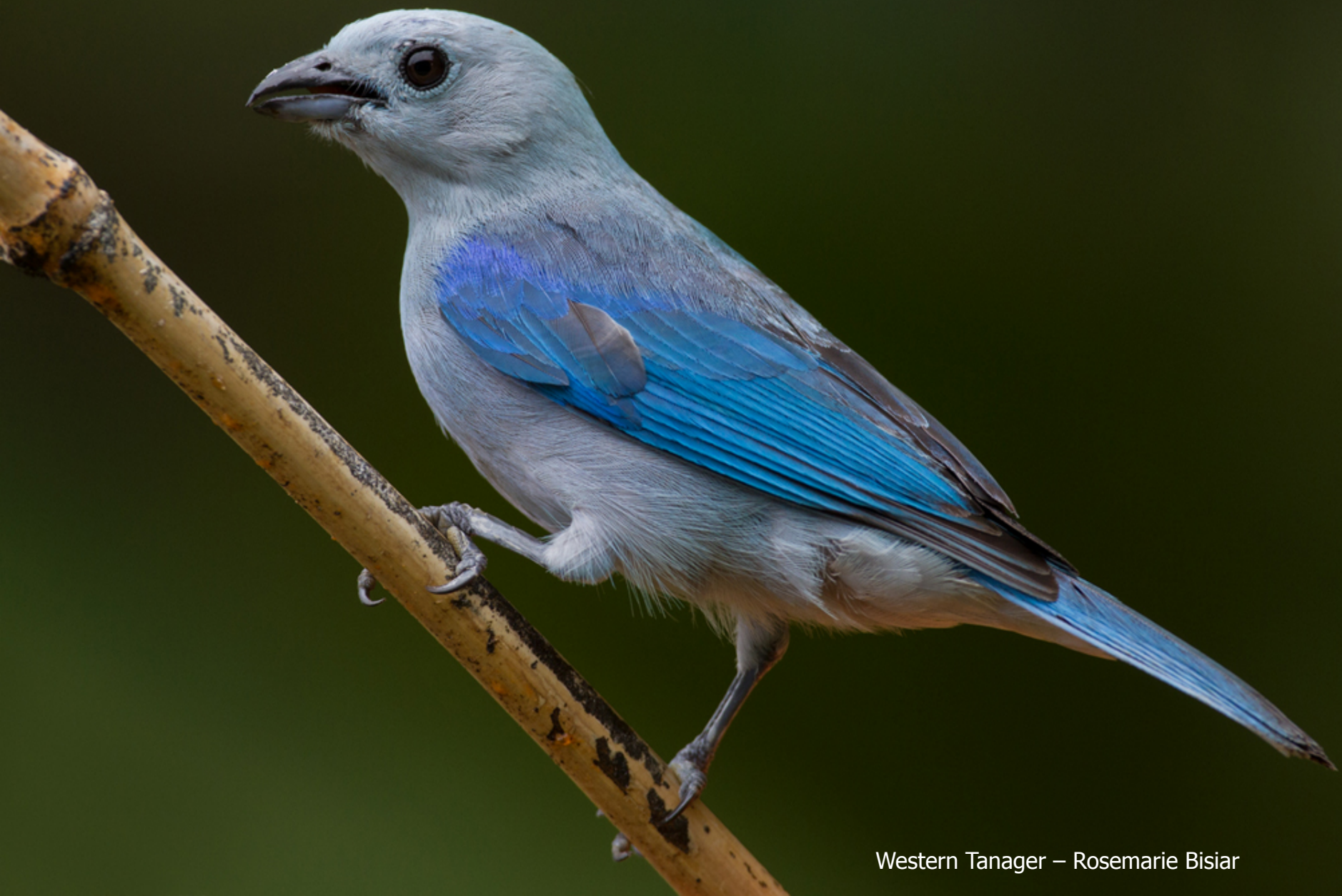
Western Tanager