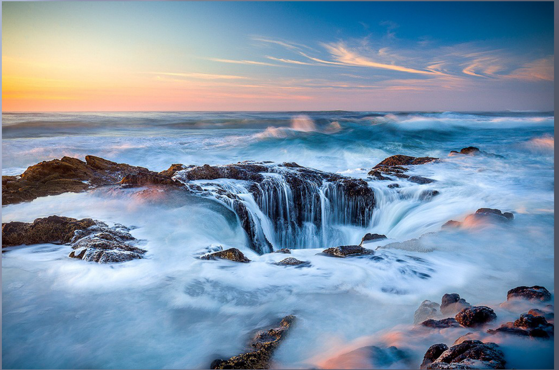
Thor's Well