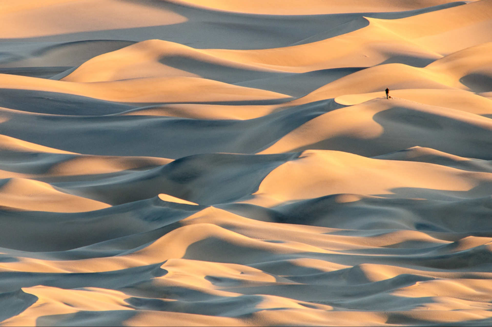
Mesquite Dunes