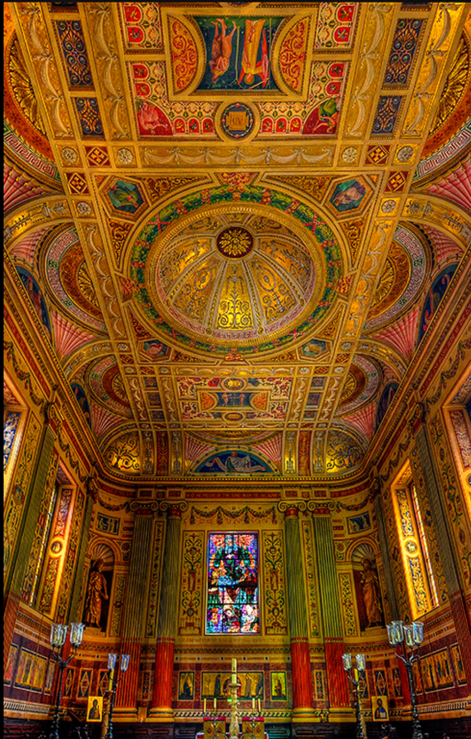
Just Another Chapel at Oxford