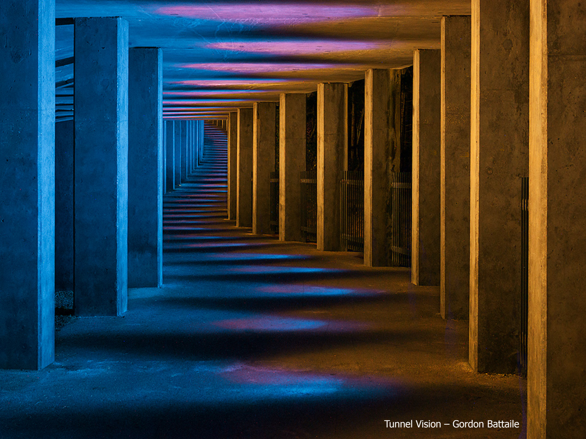
Tunnel Vision – Gordon Battaile