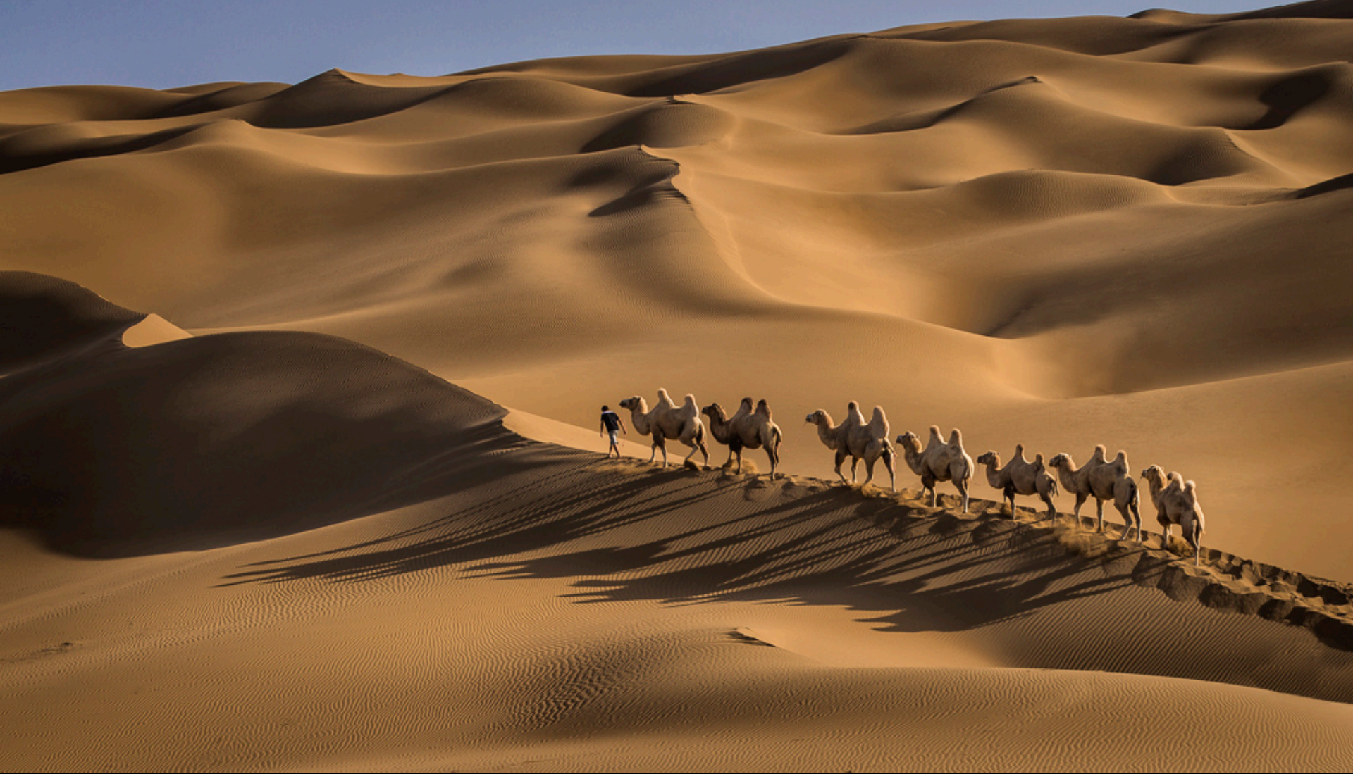
Camels in a Line 3 – Sharp Todd