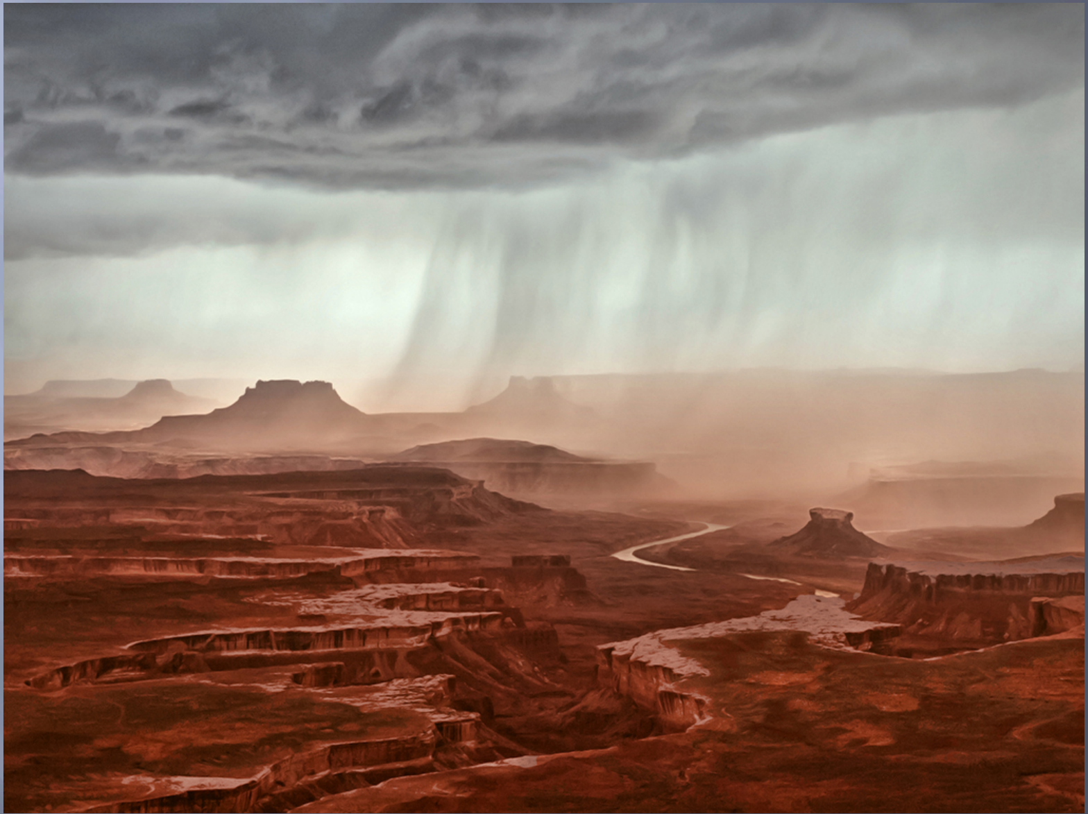
Storm at Green River by Vivian McAleavey, SOPA