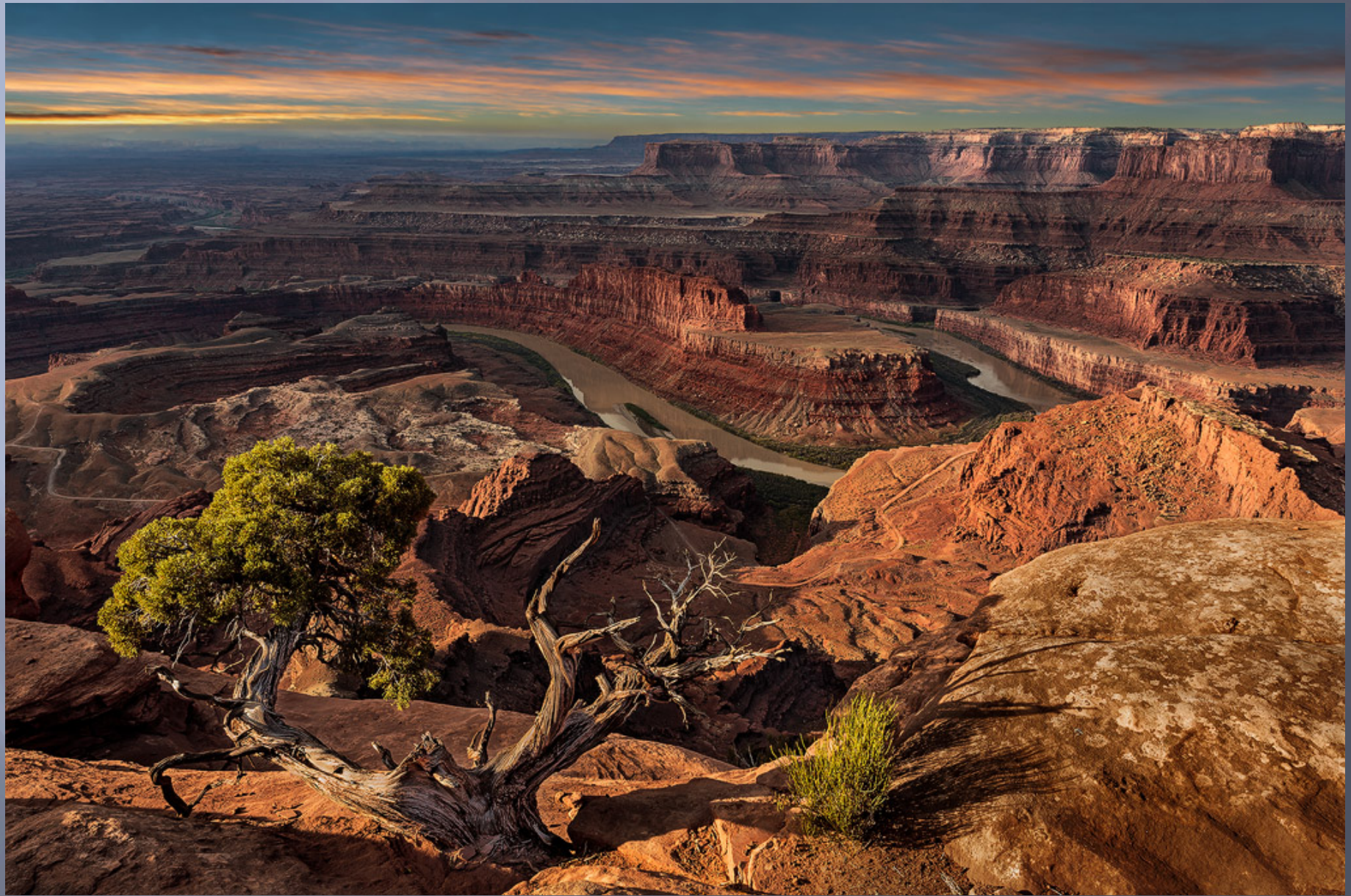
Dead Horse Point, by Tad Hetu, FGCC