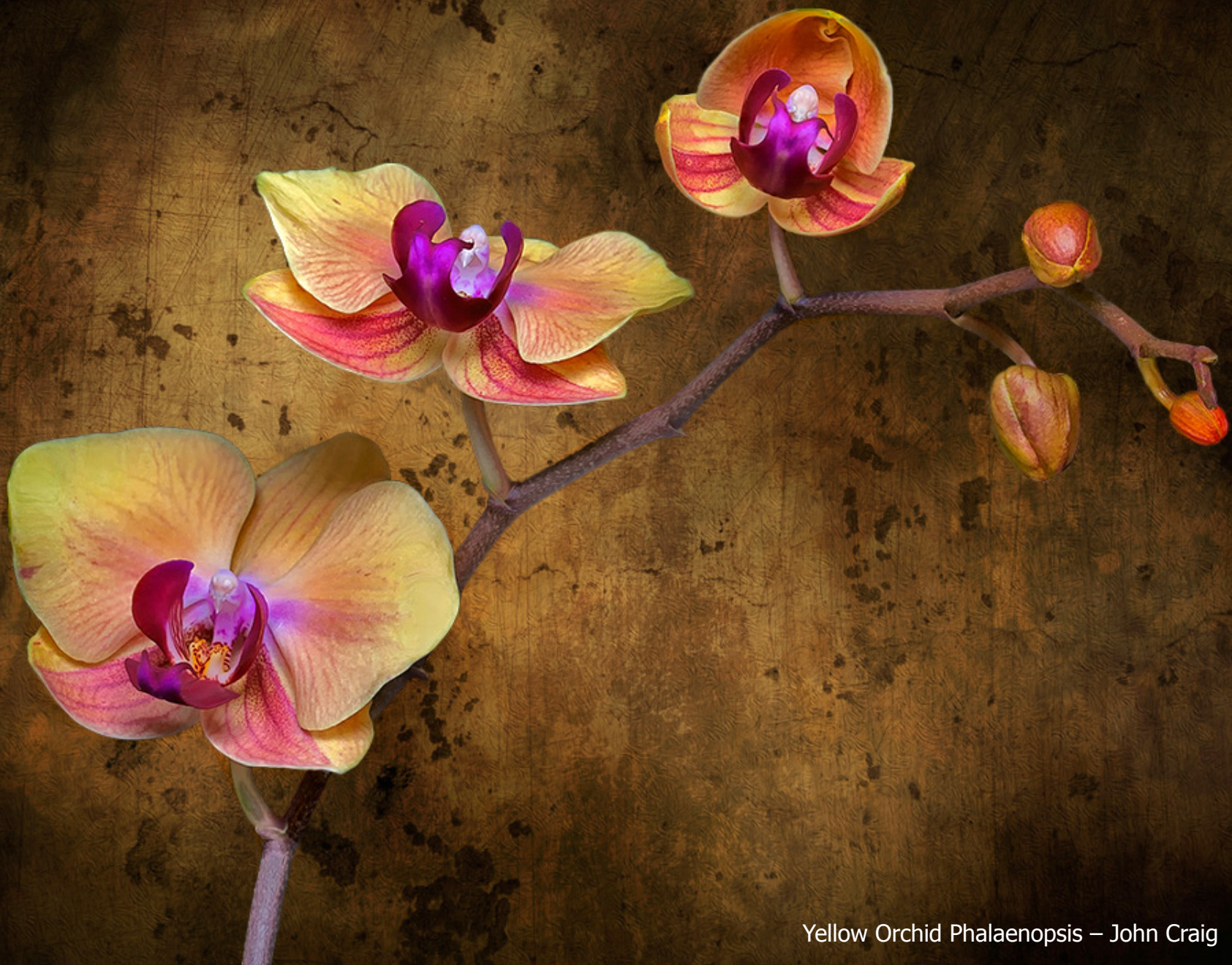
Yellow Orchid Phalaenopsis