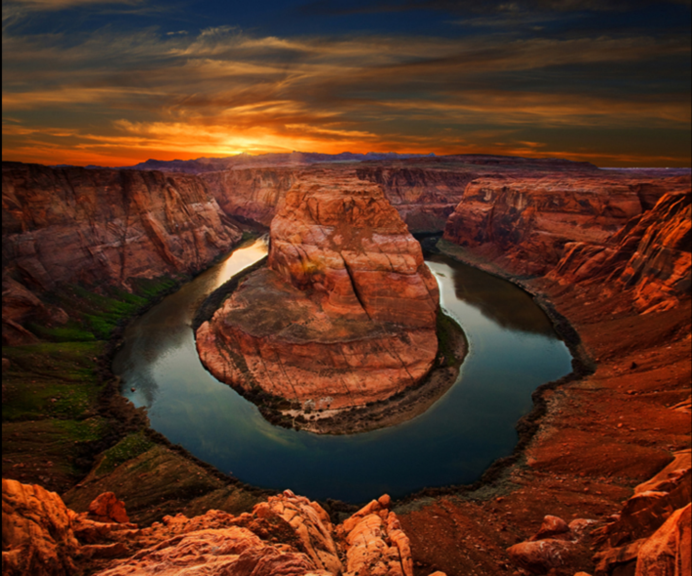
Horseshoe Bend Sunset