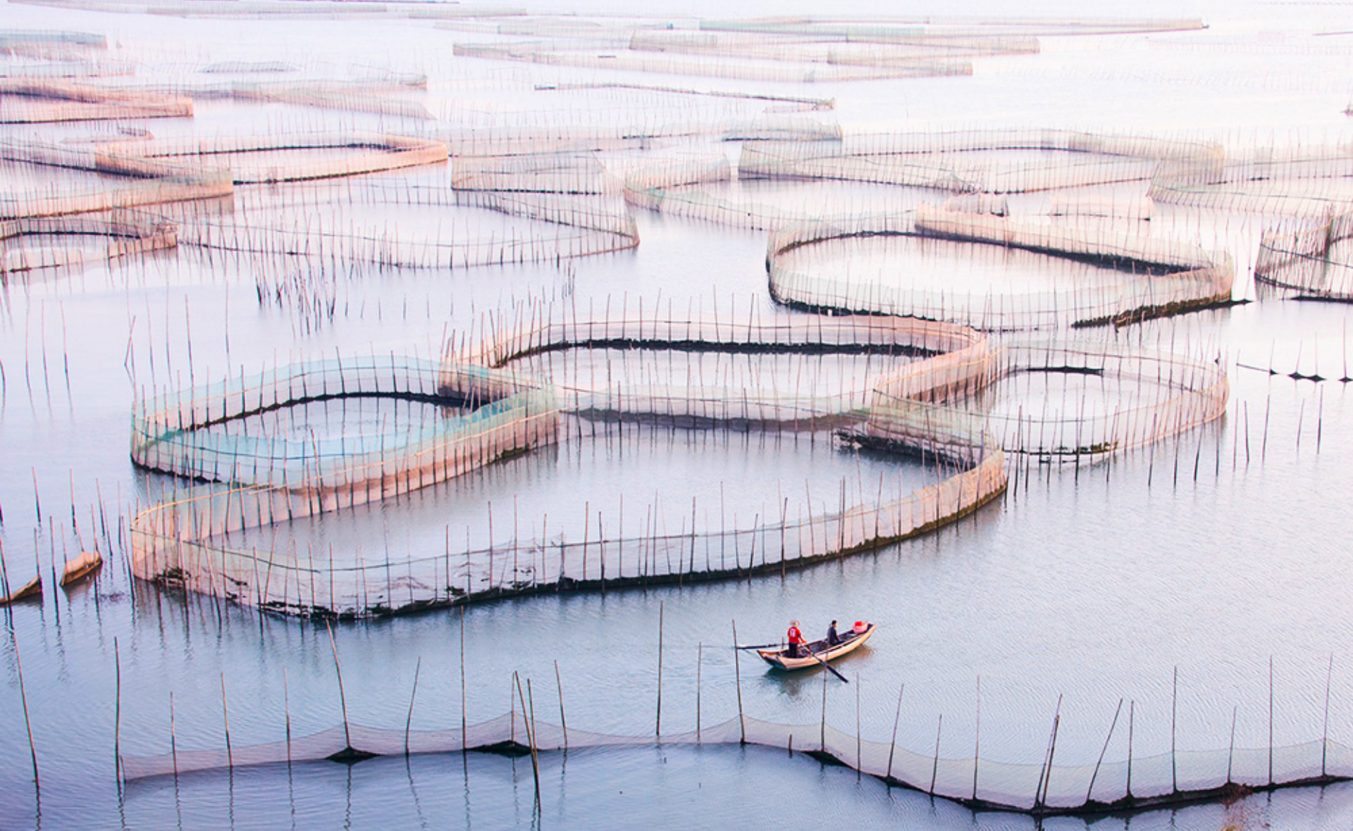
Fish Traps – Su Zhou