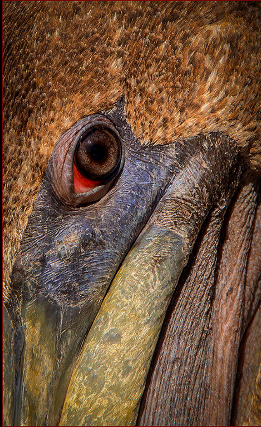
Plain Brown Wrapper