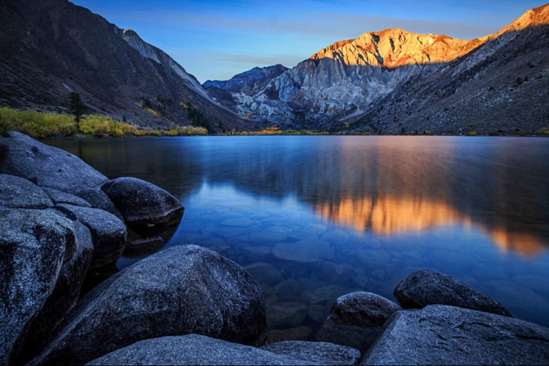
Convict Lake – Gina Reynolds