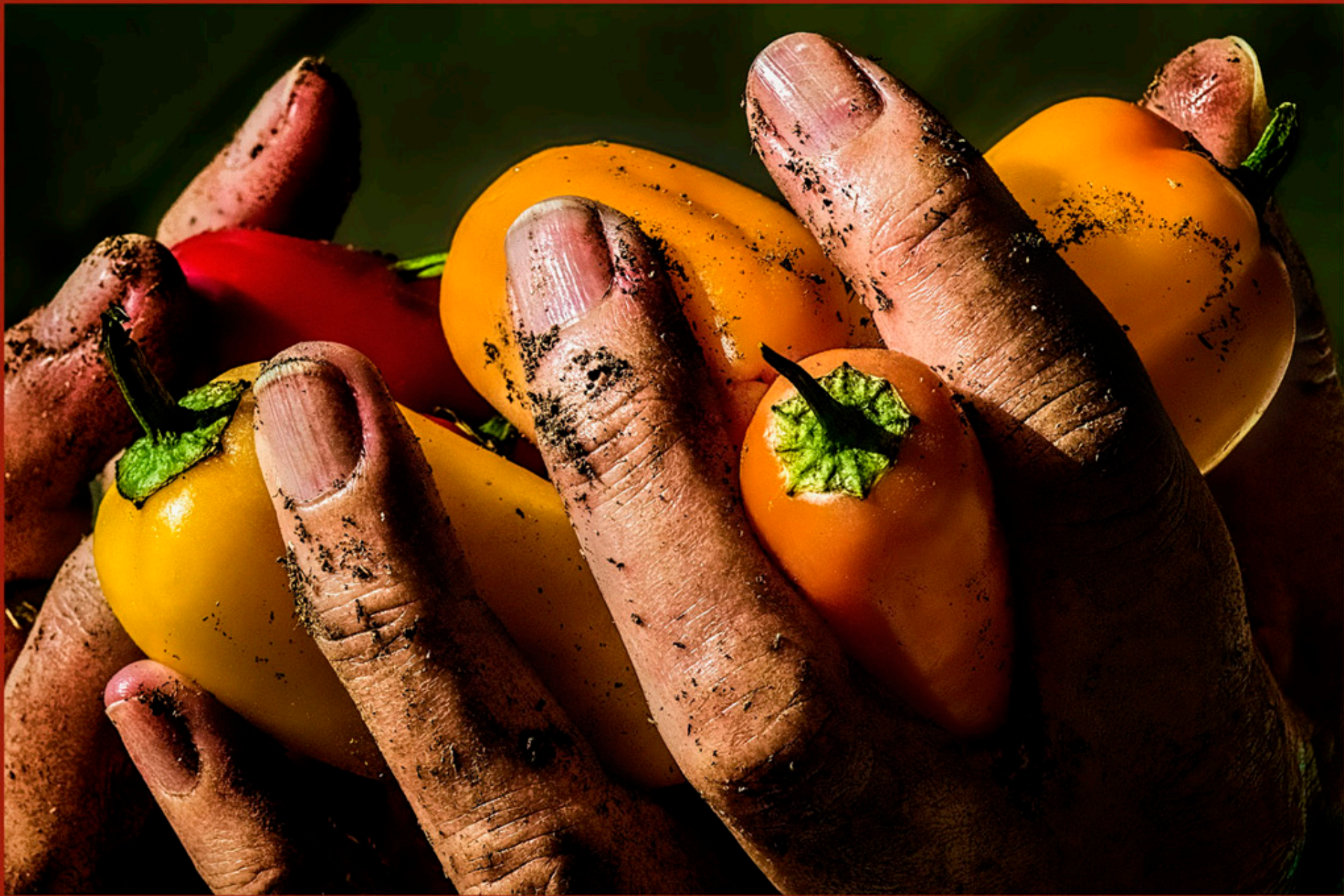
Fist Full of Peppers – Craig Leavitt