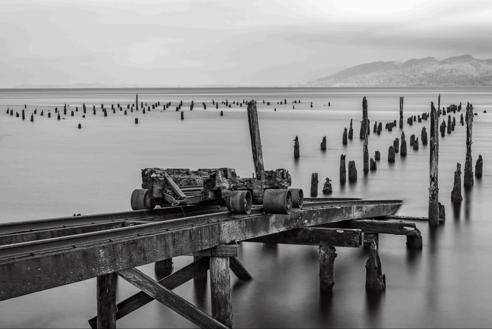
Cannery Trolley