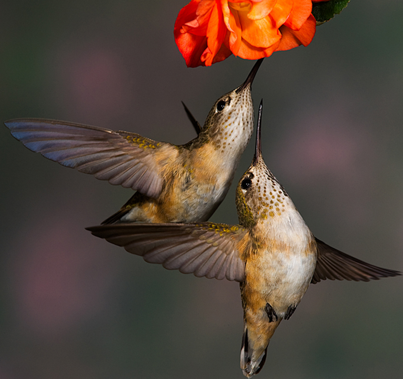
I Was Here First – Gene Davis