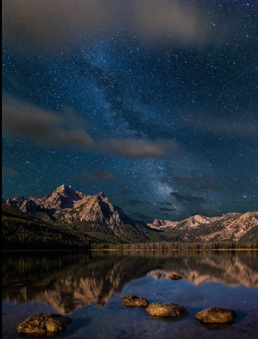
Stanley Lake Under the Stars