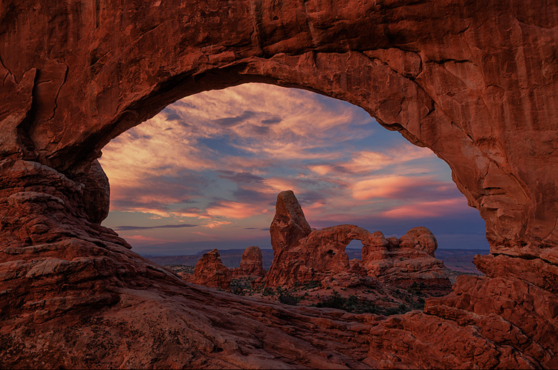
Predawn Window – Drinda Battaile