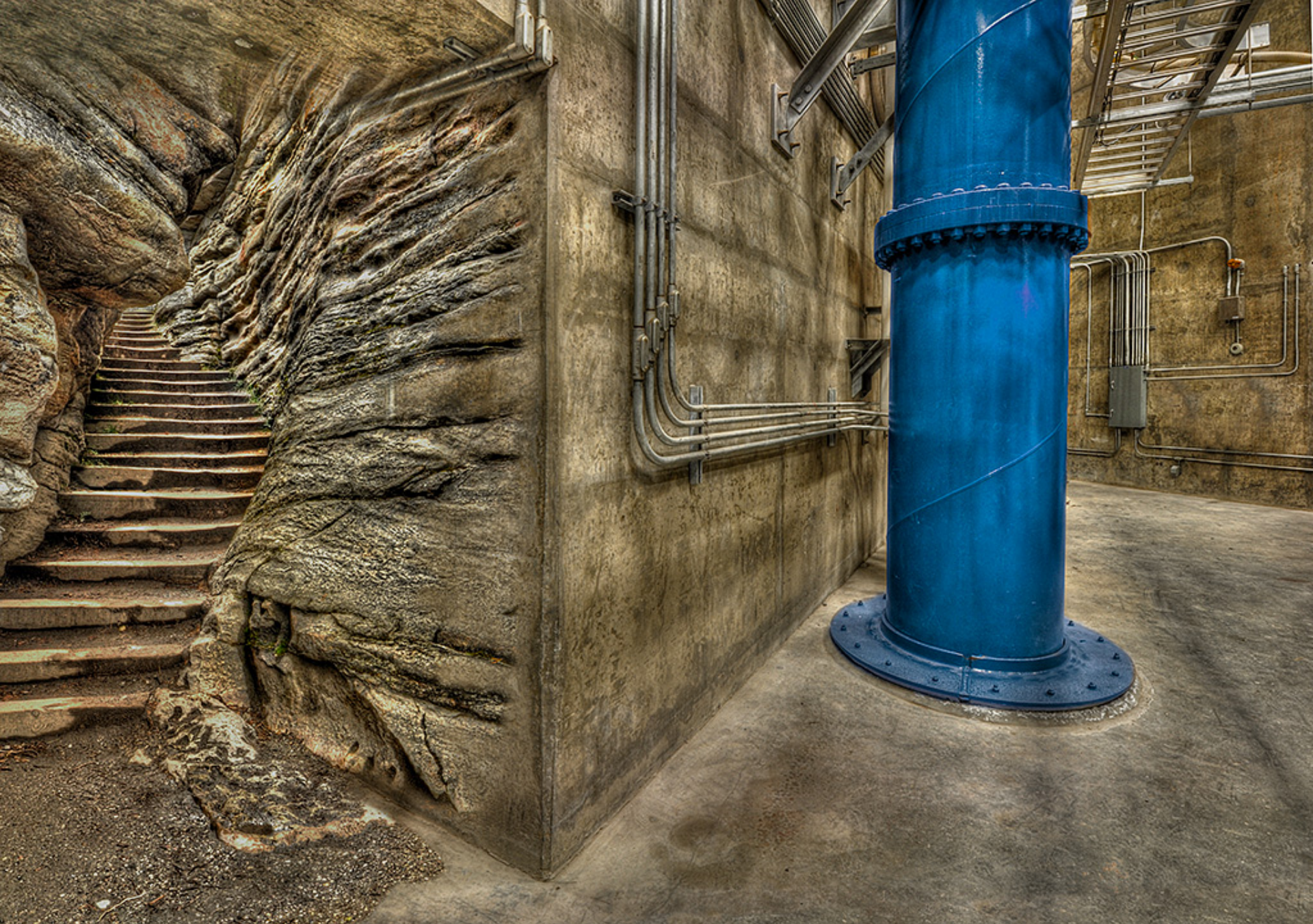
Athabasca Pumping Station – Gordon Battaile