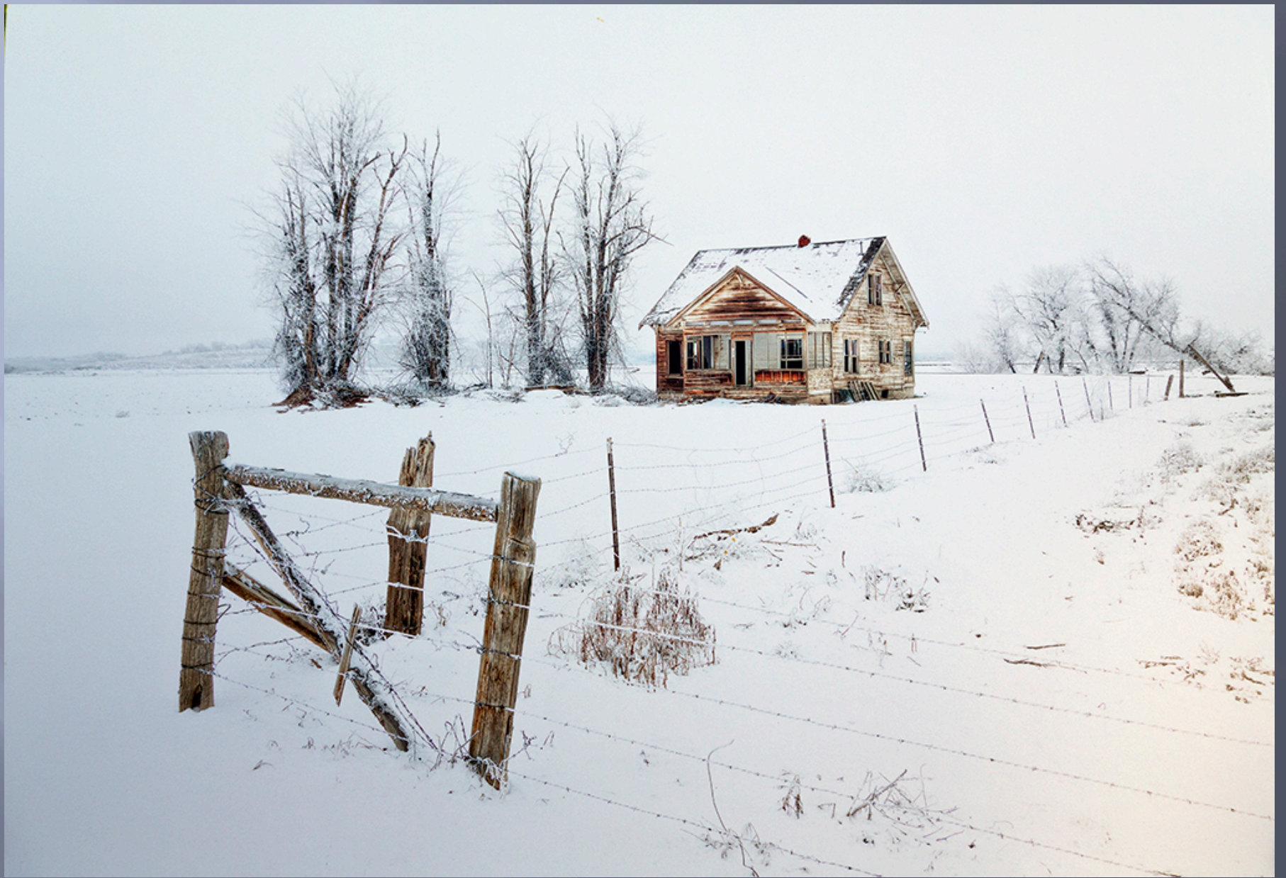
Abandoned, by Laren Woolley, YAAP