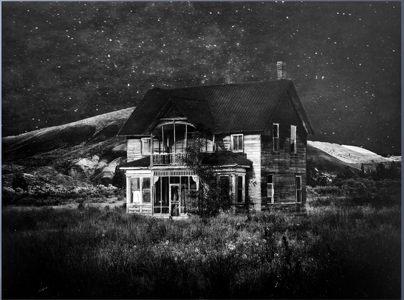
Moonlight Night, by Rudy Dierks, SOPA