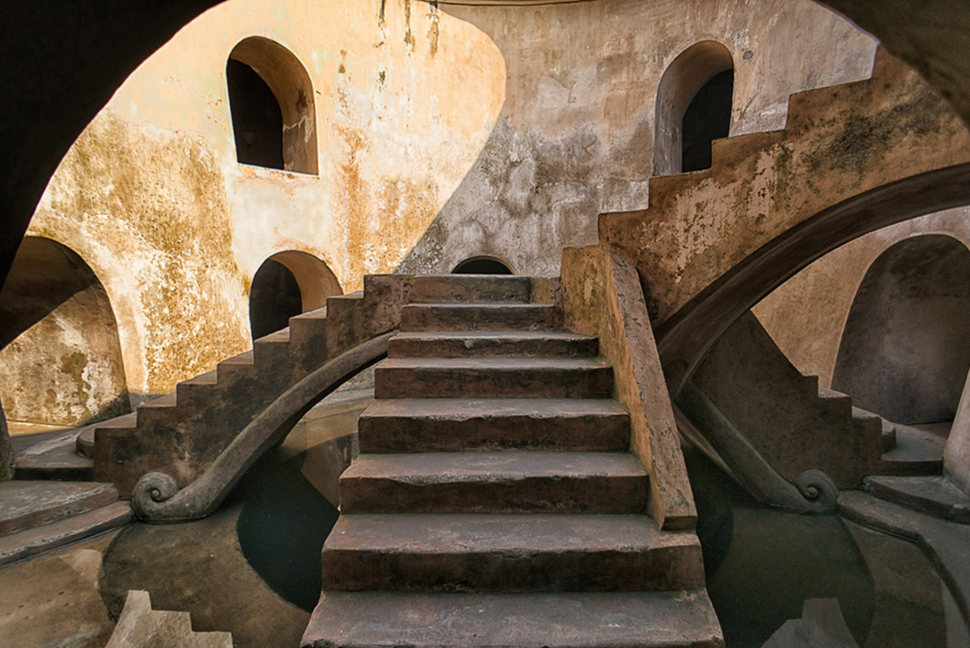
Underground Mosque, by Ross Kaplan, PPS