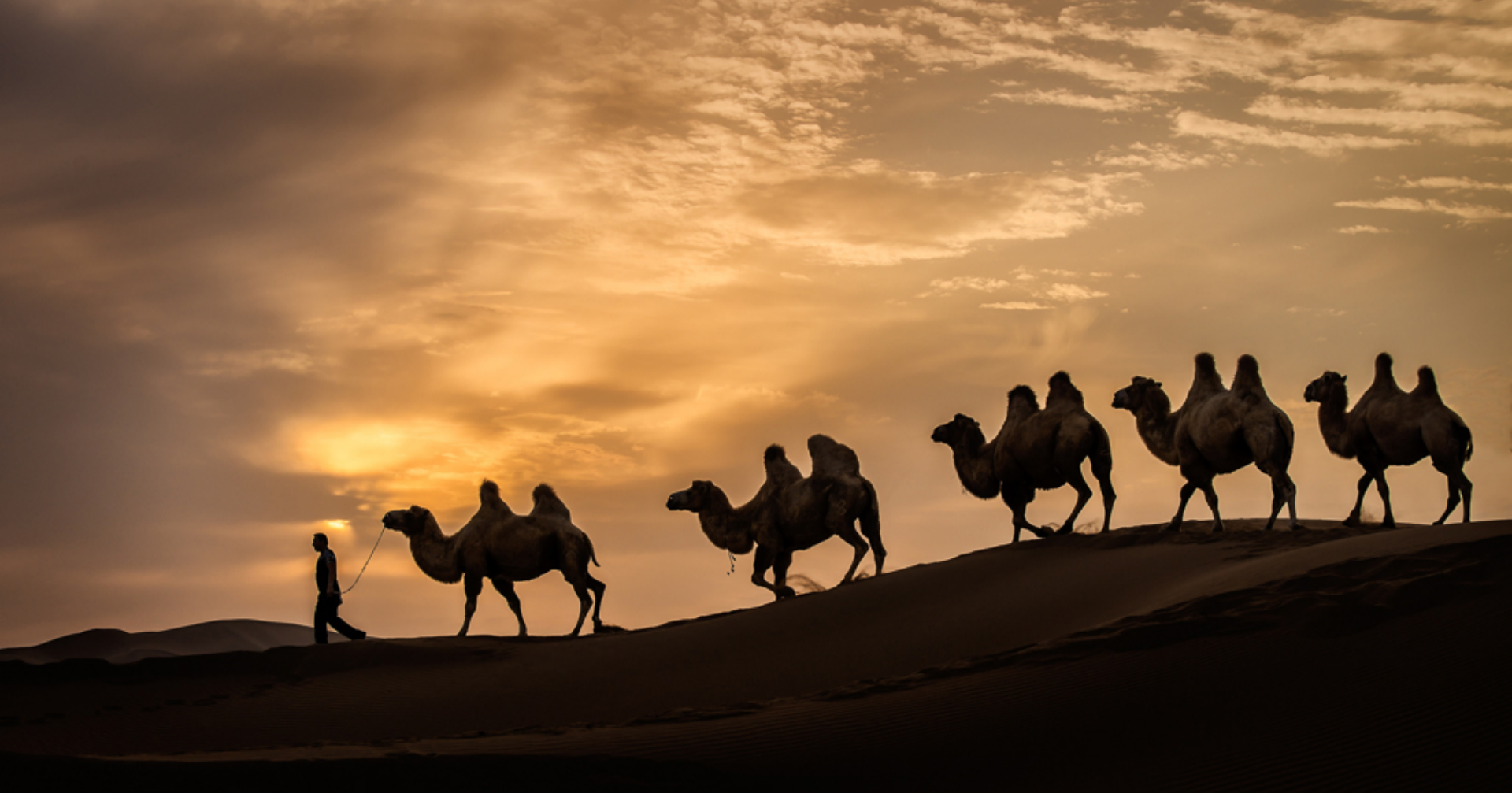
Camels Going Home, by Sharp Todd, FPCC