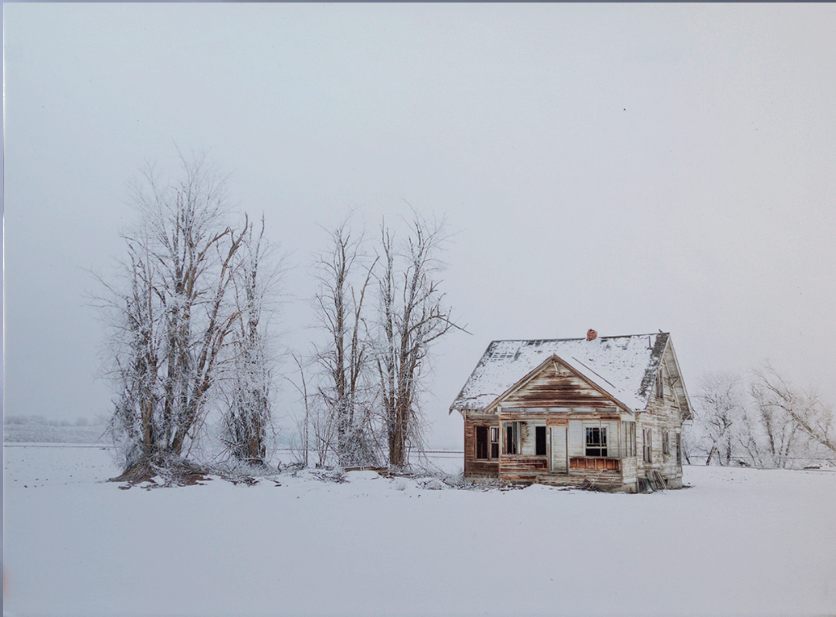
Forgotten, by Laren Woolley, YAAP