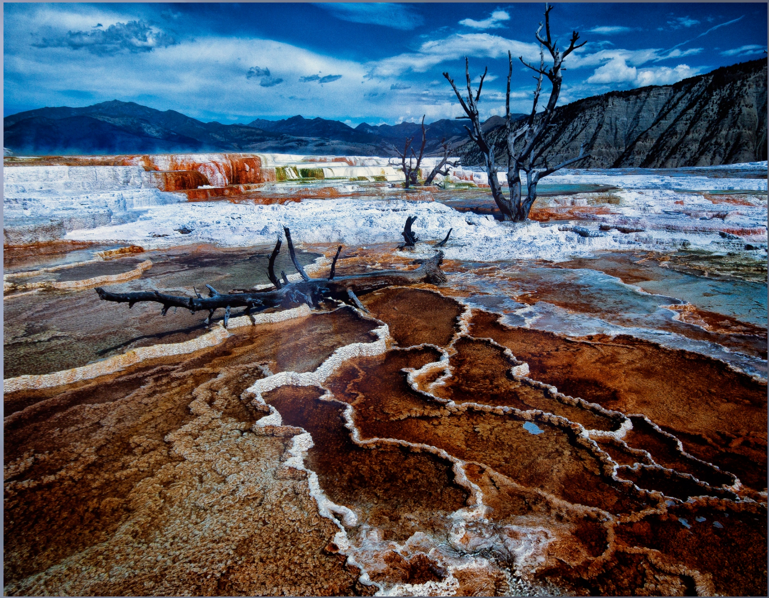
Mammoth Hot Springs #2 Sharp Todd, FPSA, GMPSA, FPCC