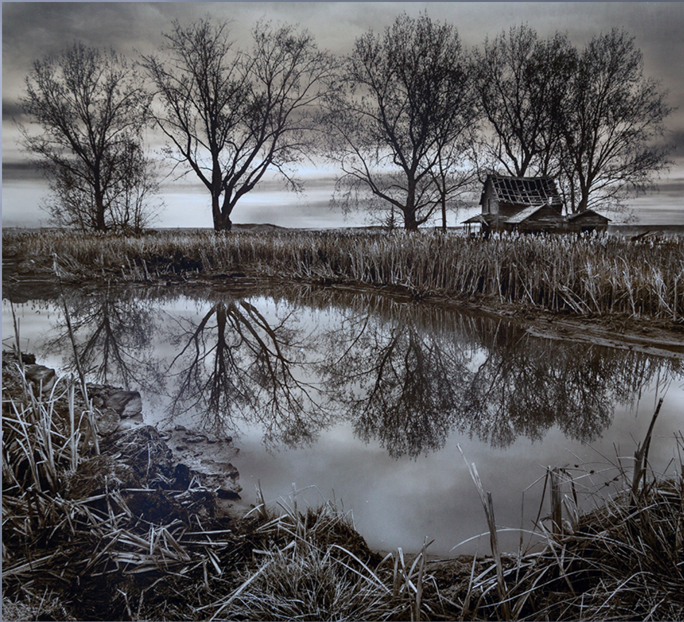
Abandoned Ranch