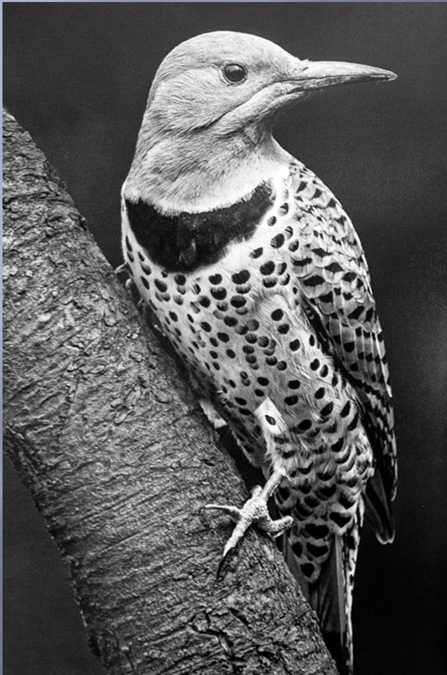
Female Northern Flicker Dan Mitchell KCCC