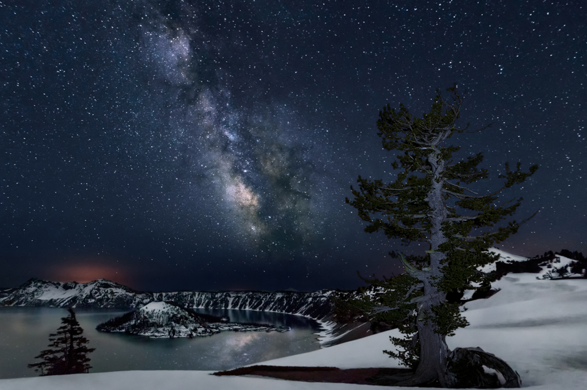
Wizard's Sentinel, by Tad Hetu, FGCC