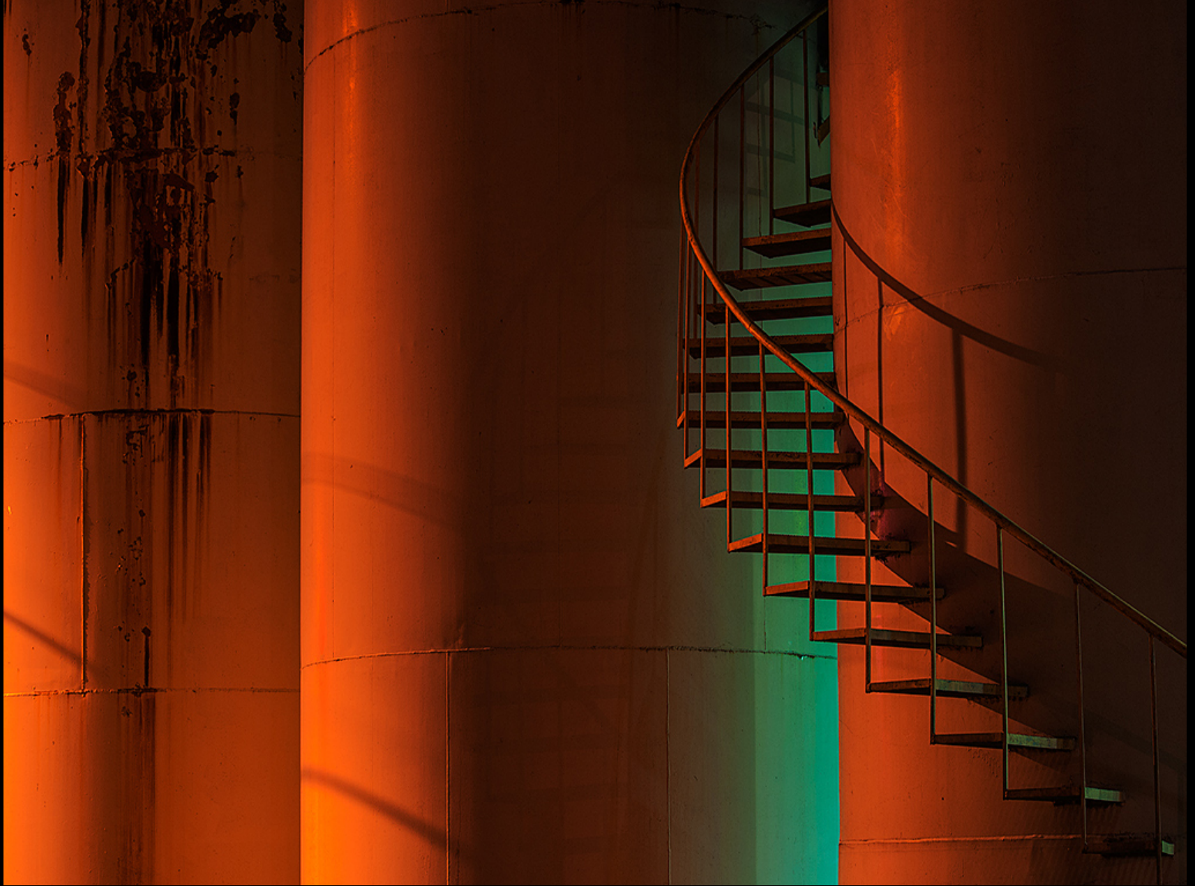
Stairway to Chevron Heaven