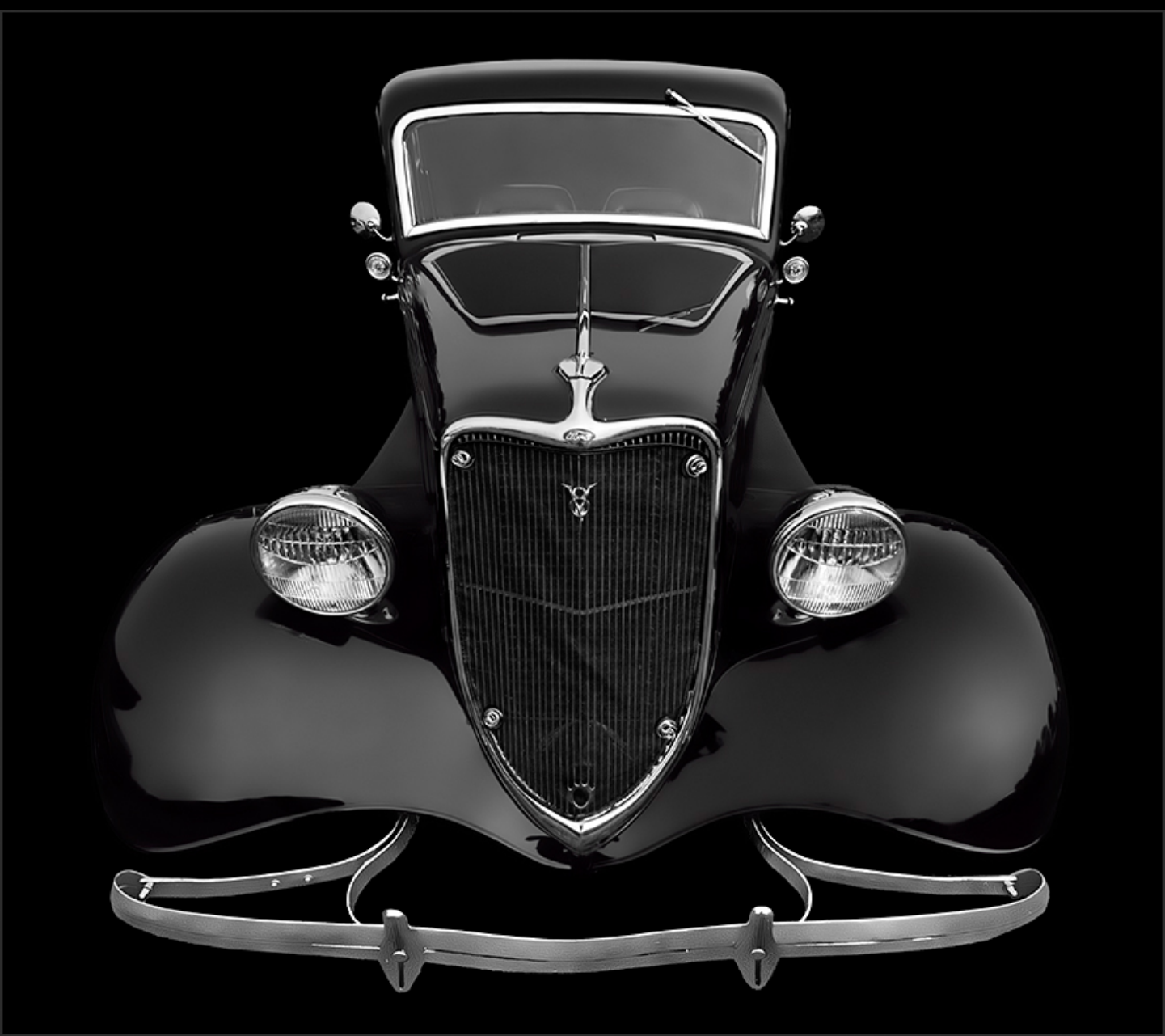
(20 pts) Shades of Black, by Dan Hottenroth, FGCC