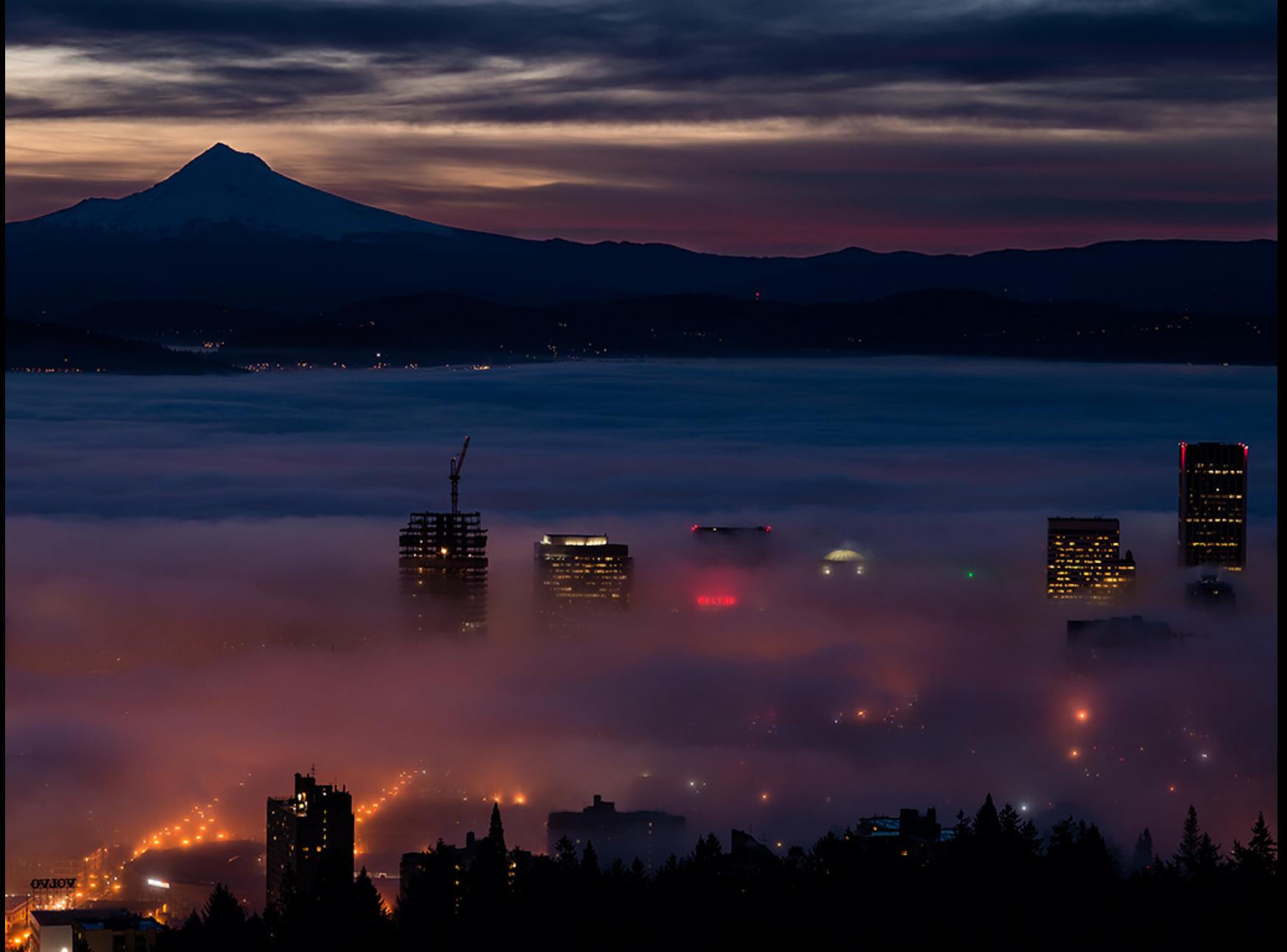
EquiLux, by Charles Edelson, FGCC