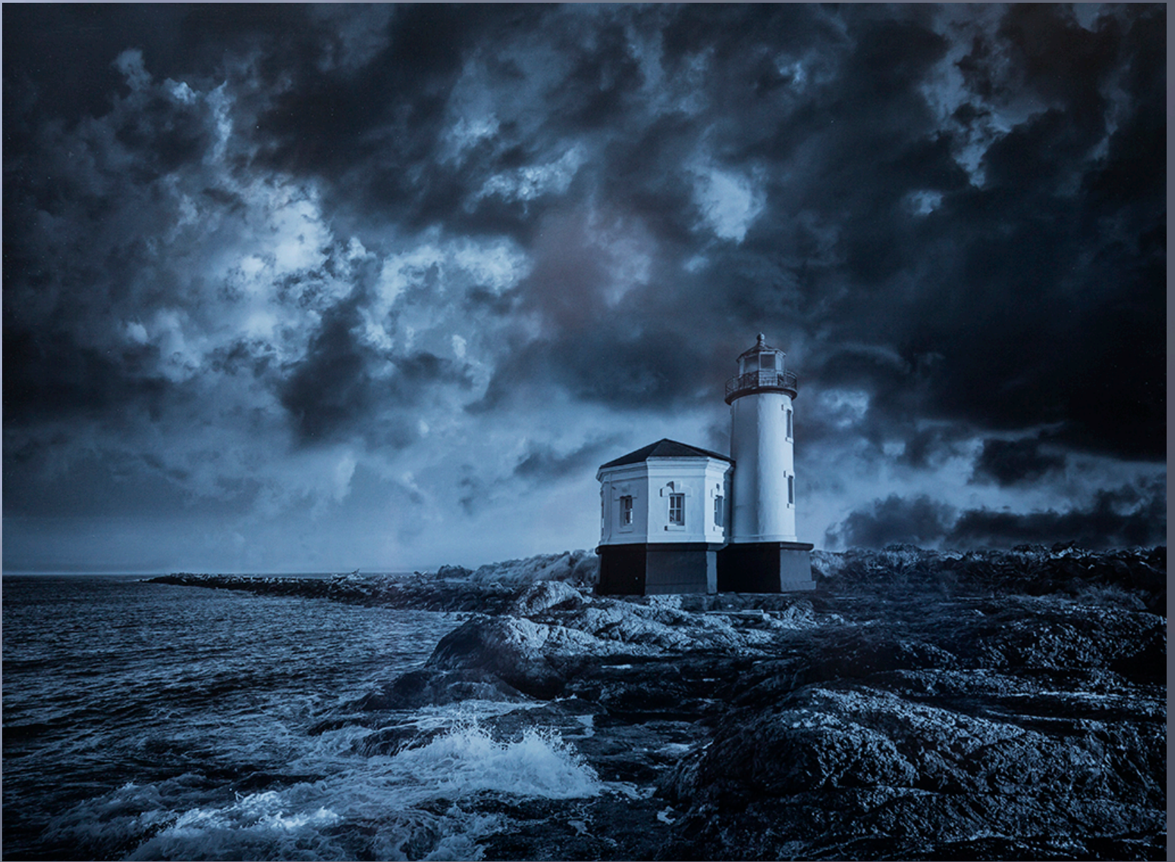
Morning Light, by Rudy Dierks, SOPA