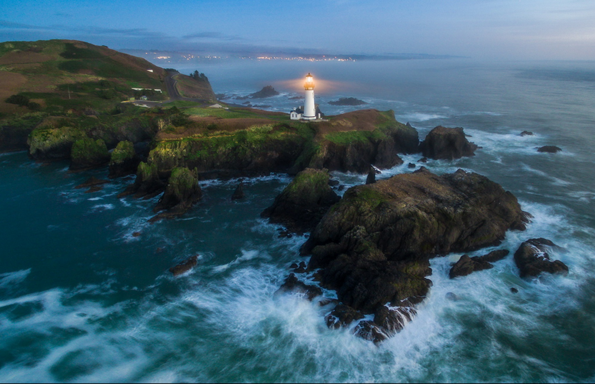
Yaquina Light, by Cody Cha, YAAP