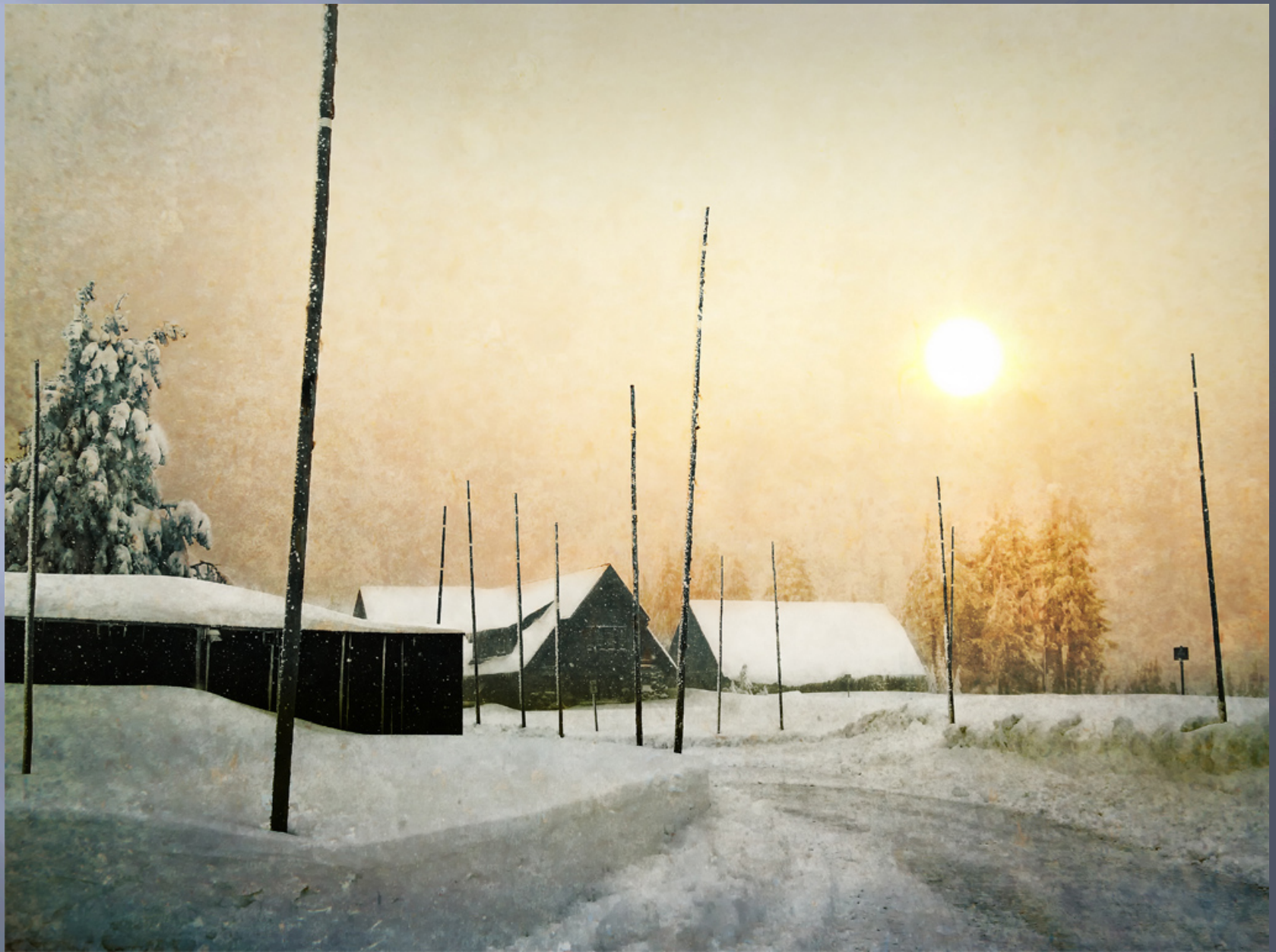
3 Feet of Snow